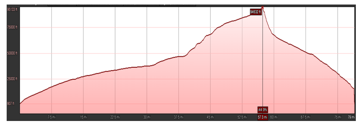
Figure 6: Graph of the altitude with respect to the total distance traveled by the balloon.