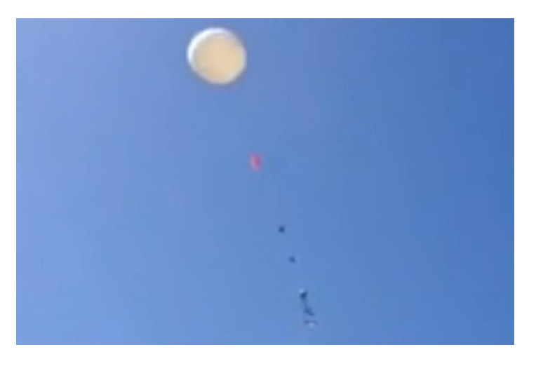
Figure 3: The balloon and payloads immediately after release.

3). Holding the modules by their connecting cord and releasing in succession stops the balloon lift from yanking each payload violently off of the ground.