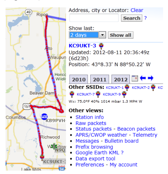
Figure 4: Screen shot of the mobile web app used for tracking.

Once in flight, the balloon and payload system soar out of sight and can only be tracked by the GPS signals. The tracking pod pings out a GPS coordinate along with its speed and direction of motion every 30 seconds or so (Czech, Fossen, Johnson, & Westphal, 2010). The signal is received by antennae secured to the chase vehicles and plotted on a map. Using StratoSat and MapPoint software, the balloon is tracked in real time. This is in addition to the web browser application that plots the balloon system's path and can be accessed by any device with internet access. This tracking application was advertised by the launch and payload teams for a wide community audience. The teams also had a record number of smart phones that could track the balloon's progress as well (Figure 4).