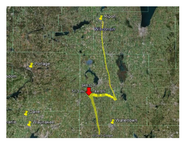
Figure 8: Superior view of the balloon's flight path in Google Earth.