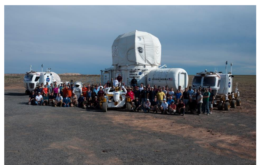
Figure 1: D-RATS team photo with the DHU-DSH, both MMSEVs, and Robonaut.

Following the current presidential administration's changes in the prescribed vision for future human exploration of our solar system (Sellers, 2012), the high level objective of Desert RATS 2011 was to test mission architectures for deep space habitation on a manned mission to a near earth asteroid (Gruener, 2012). The annual recurrence of Desert RATS allows teams to rapidly deploy and test new concepts in a safe working environment. Exhibiting a short turn-around time of approximately one year, the "tiger team" approach of the D-RATS management allows for faced