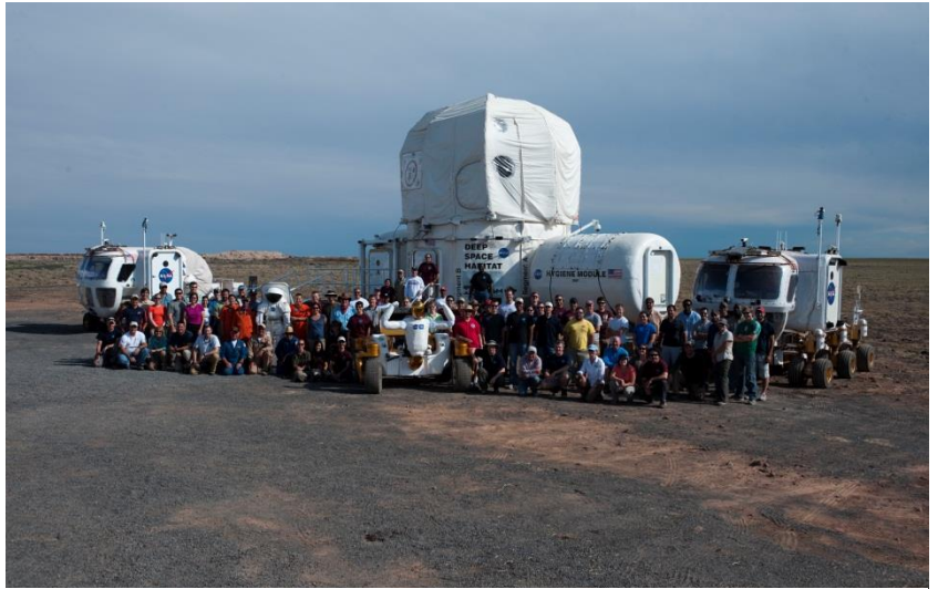
Figure 1: D-RATS team photo with the DHU-DSH, both MMSEVs, and Robonaut.