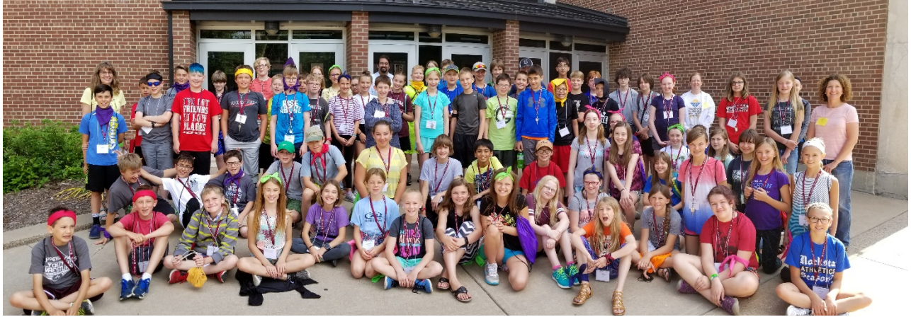
Fig. 10. 2018 campers along with some of the programs' instructors.