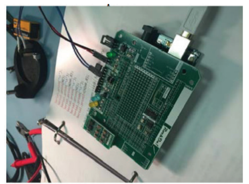
Fig. 2: The Arduino Mega with RockOn shield in an early stage of assembly and testing.

Each team receives a box filled with more than seventy labeled plastic bags containing resistors, capacitors, diodes, circuit boards, and the other items needed for the payload. Teams are also supplied with binders containing the presentation slides for the assembly and testing, circuit schematics, forms for recording testing results, and part lists. These materials are also available on the RockOn website. With the close supervision and the support from the RockOn staff, participant build the payload from scratch in three days. The payloads each consist of a Geiger counter, tridirectional gyroscopes and accelerometers, pressure, temperature, and humidity sensors, an Arduino Mega microcontroller, and a microSD drive. The provided kit includes the printed circuit boards for the Geiger counter