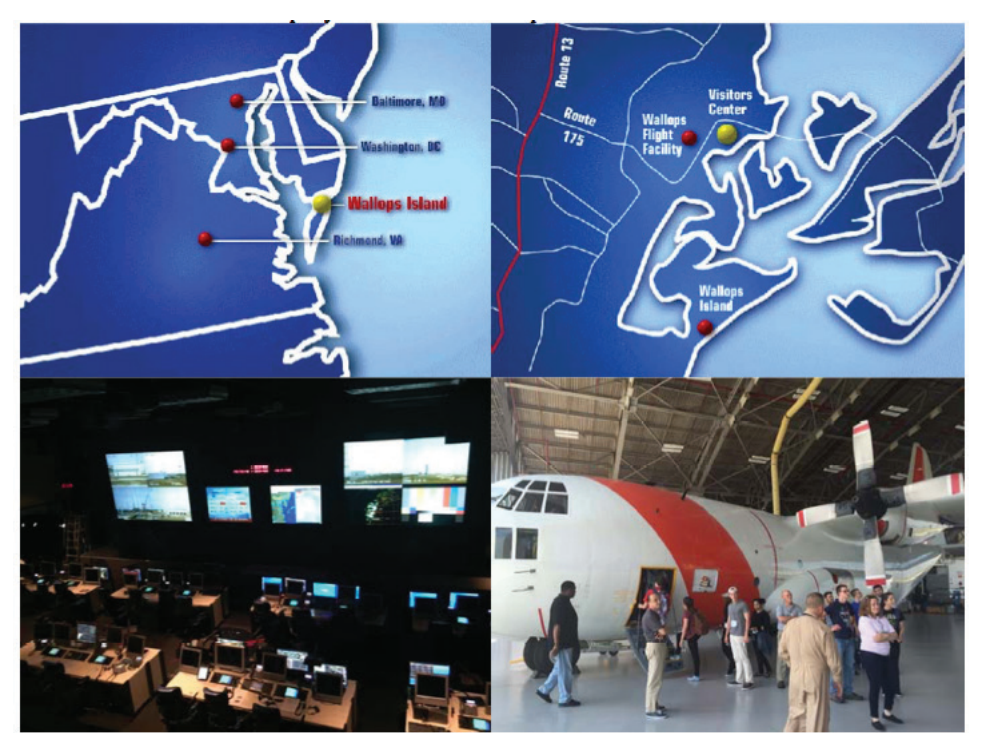
Fig. 1: Upper Left: Map of Wallops Flight Facility (WFF) on the eastern shore of Virginia. Upper Right: Map of the area around WFF and the individual bases. Lower Left: The aircraft hangar on base.

RockOn takes place at the Wallops Flight Facility (WFF)<sup>4</sup>, which is located about 160 miles from Washington, D.C., on Virginia's east coast, as shown in Figure 1 The WFF is primarily involved with science and exploration missions, including the support of sub-orbital research rockets, also known as sounding rockets. Their other activities include high-altitude balloons, navy operations, and launches of the Antares rockets that supply the International Space Station. The facility is split into a main base, where we lodged and where most RockOn and other WFF work takes place, and the launch base on Wallops Island, where the actual launch occurred. As part of the recruitment and outreach mission of the RockOn program, workshop participants get tours of the facility, hear about NASA internship opportunities, and have access to NASA employees across WFF operations.