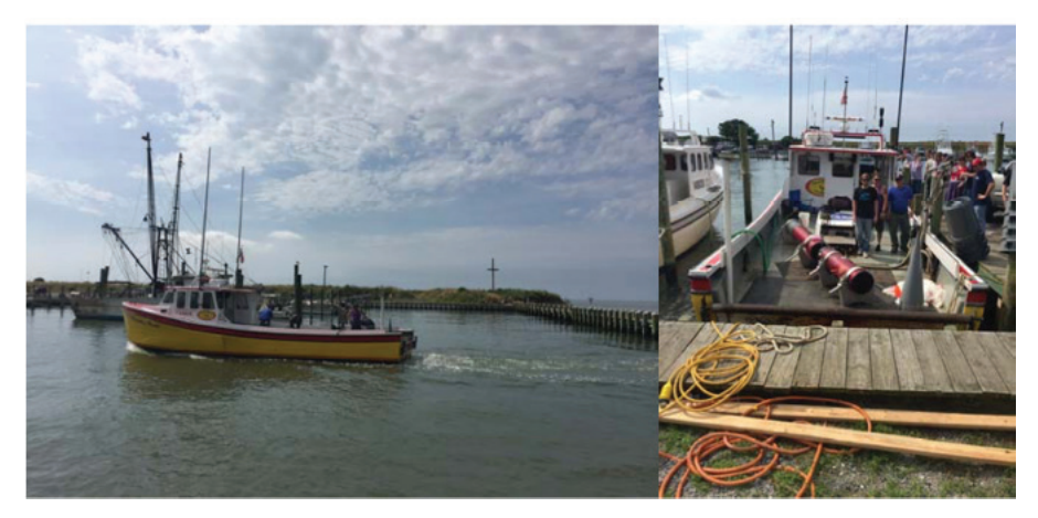
Fig. 5: Recovery of the rocket.

Our payload was a success and recorded data from launch until we removed the batteries from our payload to retrieve the data. Our sensors received only rough (if any calibration), though our data show several interesting features. The accelerometers show the two stages of the booster rockets. The gyroscopes showed a rocket initially rotating about the launch axis tumbling back to Earth after reaching apex. The temperature and pressure climbed during launch before virtually stabilizing, while the humidity also climbed during launch before falling (The pressure data revealed a dramatic fall when the rocket was opened following recovery, while the temperature and humidity showed this fall followed by significant variation as the payload was transported across the base before the batteries were disconnected).