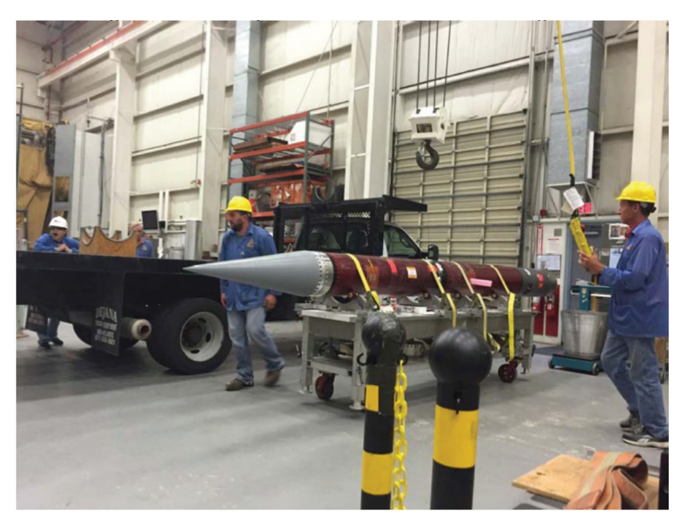
Fig. 4: The completed payload section of the rocket being loaded onto a truck to go to the launch facility.

At the launch facility, the payload half of the rocket was loaded onto a two stage booster and slid onto a railing to guide the launch direction. It was aimed slightly east to carry it over the Atlantic Ocean for a safe recovery. For the fist time in RockOn history, the launch was delayed to the second day of the launch window due to poor weather; a (strongly) severe thunderstorm passed over Wallops on the first day; it was clear enough to launch the rocket at 6:00 AM Eastern time, the very beginning of the second day. The first stage of the booster was not securely attached to the second; the pressure of the launch kept them coupled until the first stage was spent and simply fell off the rocket before the second stage ignited. The entirety of the RockOn and RockSat program was gathered to watch the launch. The rocket rose to about 73 miles above Earth's surface, collecting data while launching, maneuvering about its axis in space for about 15 minutes, and falling back to Earth.